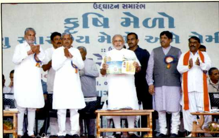
Release of documentaries and publications on agricultural technologies

Eight Audio visual documentaries on various agricultural technologies viz, High-Tech Agriculture, Water Conservation, Dry Farming, Bio Fertilizers & Manures, Integrated Disease & Pest Management, Care of Milking Animals, Value Addition in Agril Produce were released by Hon'ble Chief Minister, Shri Narendra Modi which were distributed to all the 4700 villages of Saurashtra region. Four Gujarati publications viz. Jamin nu Amrut (necter of soil), Telibiya pako ni kheti (Cultivation of oilseed crops) and Pak Sanrakshan (Crop protection) and Krushi Kranti na Path Darshak Kheduto (Farmers: agricultural revolution pilotman) were also released.