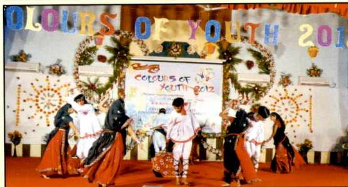
Annual Day function 'Colours of Youth 2012' of students of College of Agriculture celebrated on April 8, 2012