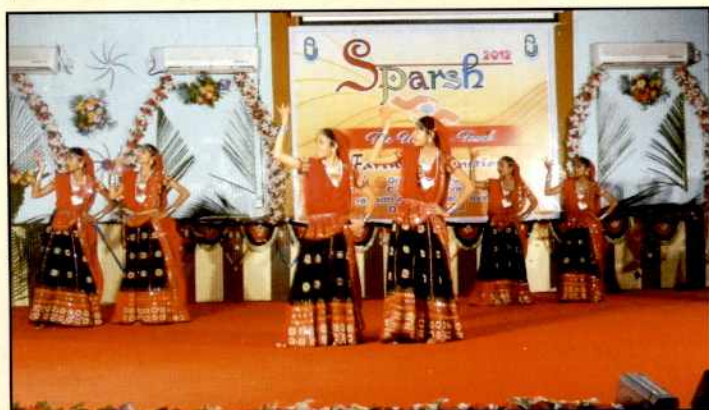
Farewell function 'Sparsh, the Ultimate Touch-2012' of students of CAET on April 11, 2012