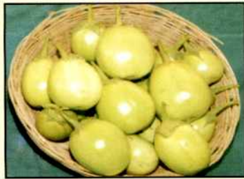
Gujarat Junagadh Brinjal-3 (GJB-3) : New variety of Brinjal