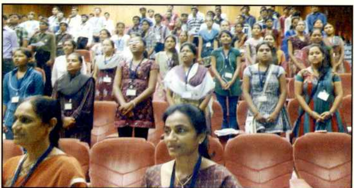
Students of JAU at State level NSS camp at Gandhinagar

A state level camp for the outstanding NSS volunteers was organized by Pandit Dindayal Petroleum University, Gandhinagar, during June 4-6, 2012. In this camp total 8 NSS volunteers (6 Boy + 2 Girl) one each from all colleges and Polytechnics of JAU participated.