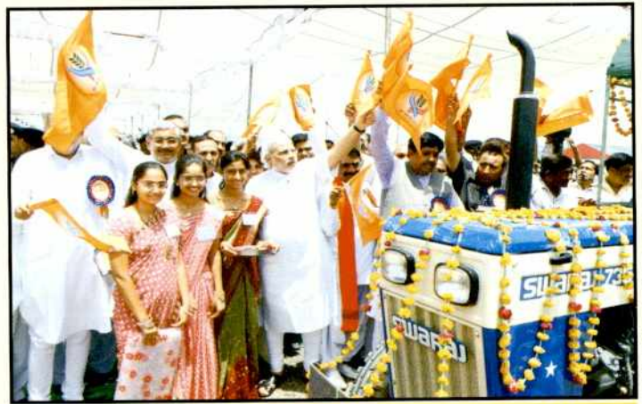
Shri Narendra Modi, Hon'ble Chief Minister flagged - off Krushi Rath at Manavadar