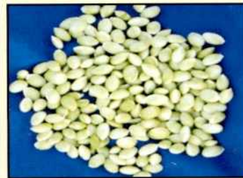
GJIB-2 : New variety of Indian Bean (Papdi)