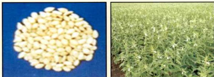
Gujarat Til-3 : New variety of Sesame

This variety is recommended for farmers of Saurashtra region growing sesame under summer season gives seed yield of 1200 kg/ha. The seeds of G.Til-3 variety are white and bold containing 47.3 per cent oil which is suitable for export.