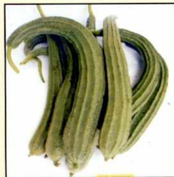
GJRGH-1: New variety of Ridge Gourd

This variety is recommended for farmers of Saurashtra and Middle Gujarat, growing ridge gourd during kharif season. This is a first public sector ridge gourd hybrid developed at Junagadh, yields 113.30 q/ha fruit which are long in size with green colour. It is moderately resistant to downy mildew and major pests.