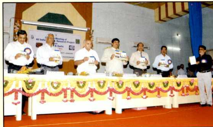
Release of book "Research Recommendation on onion and garlic"

Total 68 scientists and 4 members of private companies from 14 states participated in the meet. Various issues related to onion and garlic like results of germplasm management, varietal, production, insect & pest management and disease management trials, etc. were presented and discussed for favour of approval.